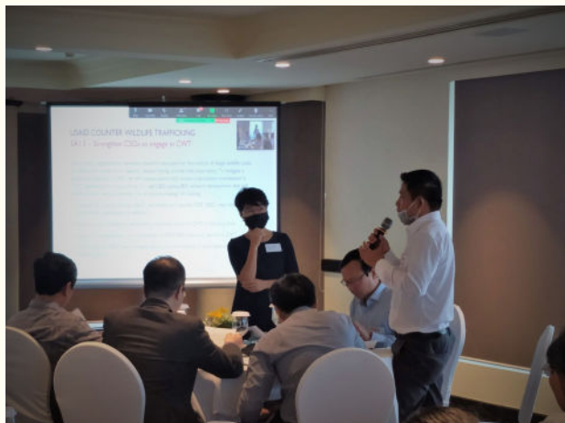
Image: Participant discussion at the USAID Saving Threatened Species SAVE facilitated by USAID Learns

Building off the findings of the GVN Project Approval Study , USAID Learns helped facilitate collaboration between USAID/Vietnam, new IPs, and the GVN to ensure GVN buy-in on new activities prior to award. Through this approach - known as the SAVE (strategic alignment validation exercise) - USAID/Vietnam hopes to ease IP efforts in obtaining project approval after award by identifying the managing agency, introducing the IP to the GVN, and obtaining GVN buy-in on activity objectives.