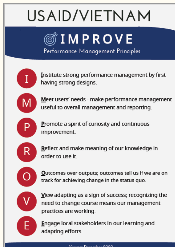
Performance Management Principles in the PMP

Last quarter, during the Monitoring, Evaluation, and Learning Officer (MELO) gathering with IPs, USAID/Vietnam shared highlights from the Mission's PMP, the guiding document for how the Mission monitors, evaluates, and learns from implementation. This quarter, USAID Learns supported IPs to align their AMELPs to the PMP. This included promoting an understanding of shared indicators; reviewing and advising on the updates; and providing guidance on the development of beneficiary feedback plans, a new USAID requirement.