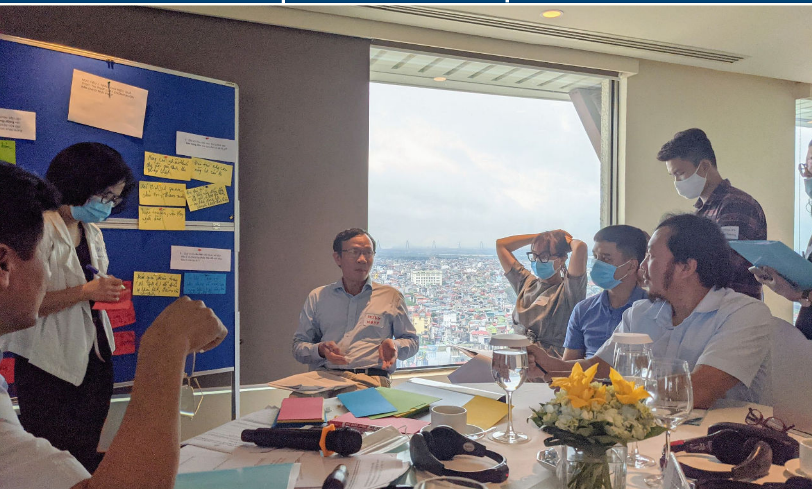
Photo: Participants sharing feedback on the new USAID Saving Threatened Species activity during the Strategic Alignment Validation Exercise (SAVE), May 5, 2021 (photo credit: USAID Learns)

Submitted by: Social Impact, Inc. July 2021