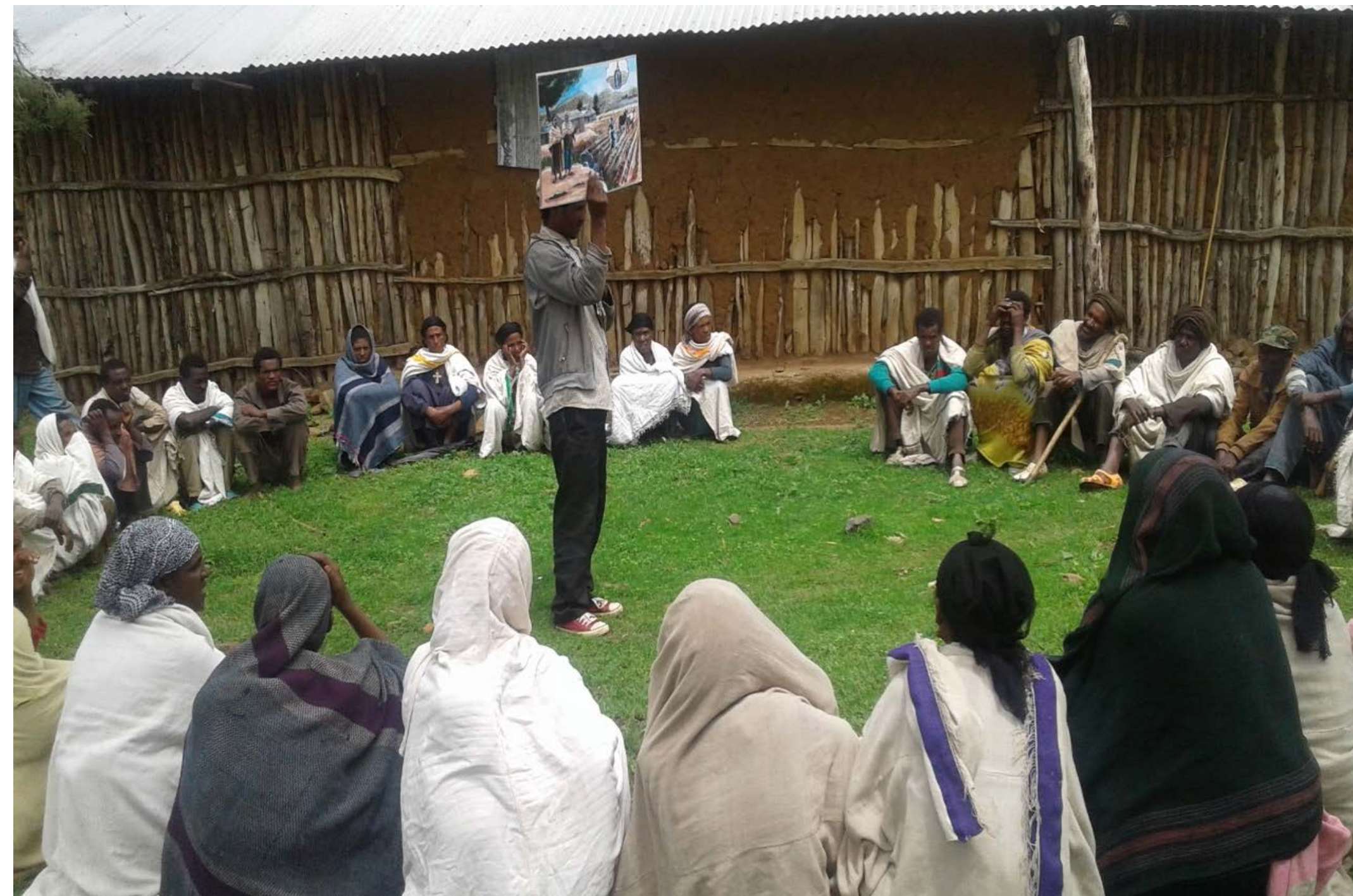
Community Facilitator for a Gender Outreach Group