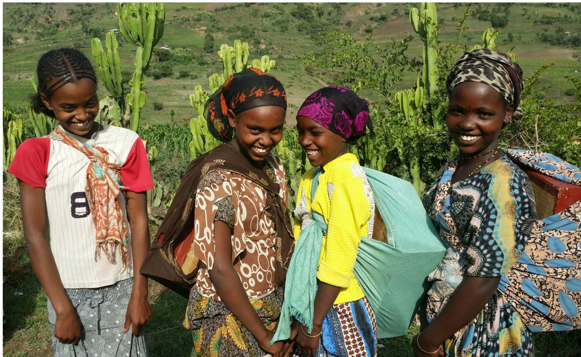
Picture of adolescent girls with their saving boxes