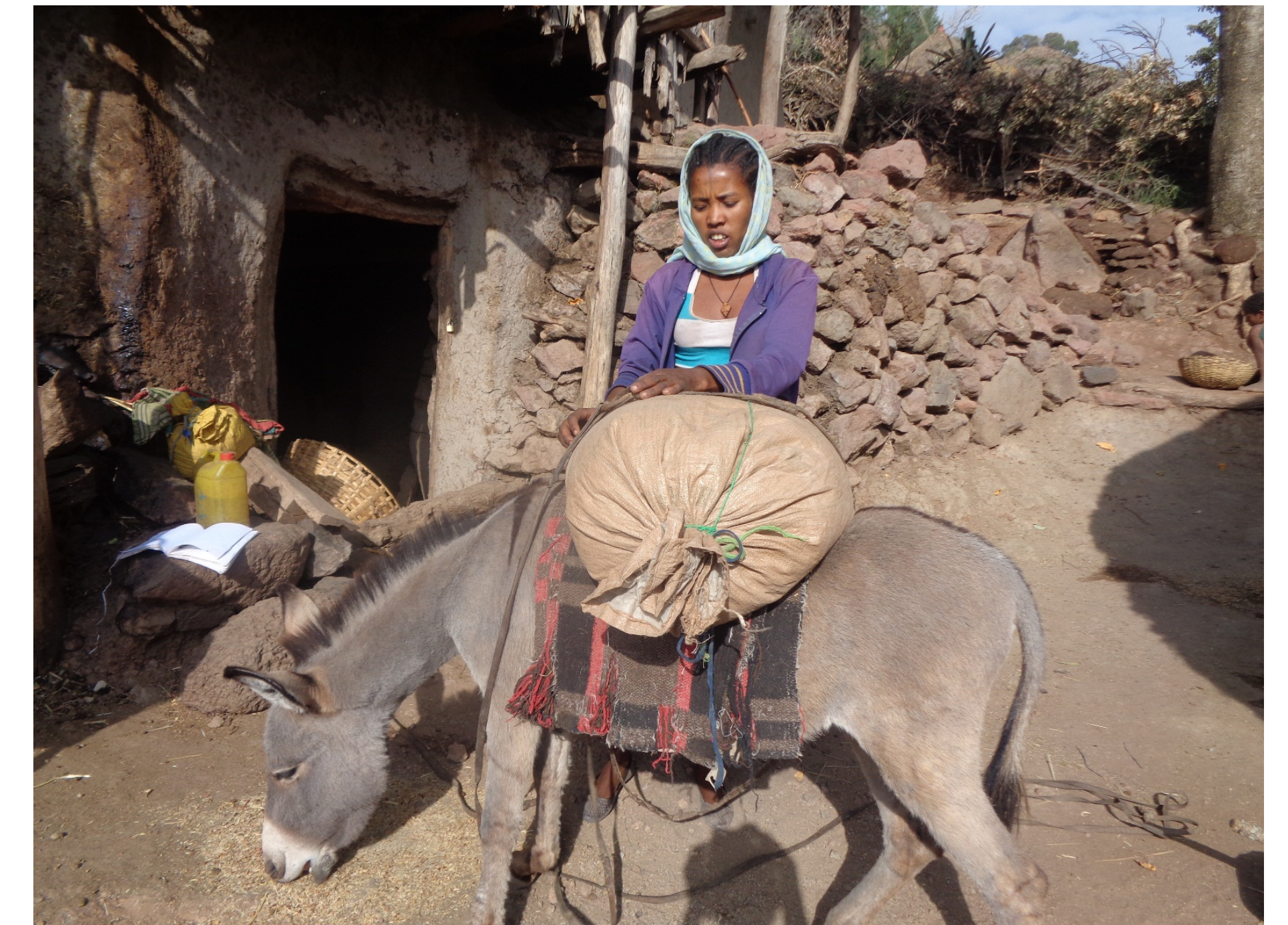
Picture of TESFA girl packing her products to sell it in the market